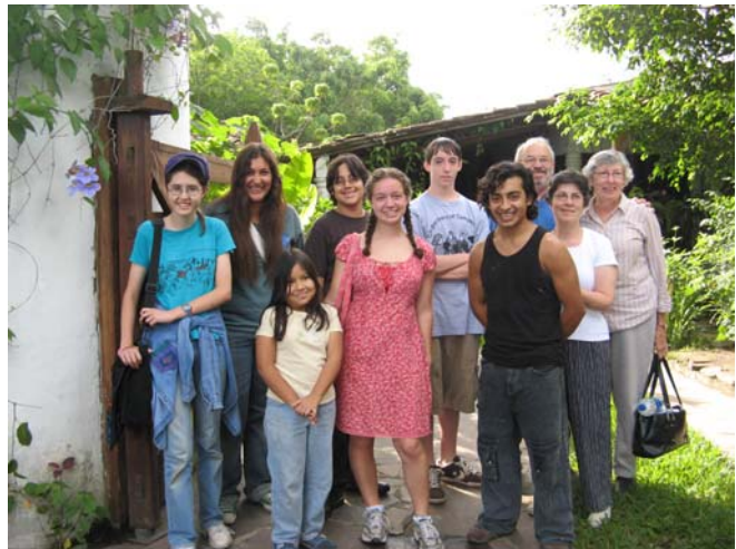
Farewell to our Residencia and our friends...

holy pictures. And there are tears and hugs as children separate from the Affirmandi, calling, "Please come back."