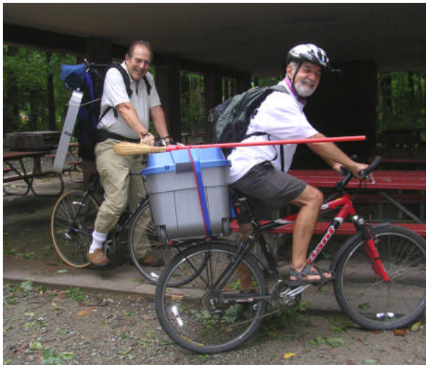
Arriving at the Environmental Liturgy — Sept 3rd.... ...notice — no gasoline used!