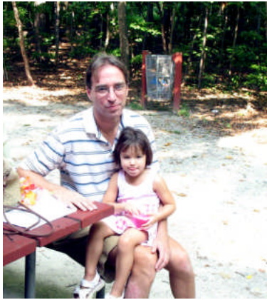
Some of the Baileys