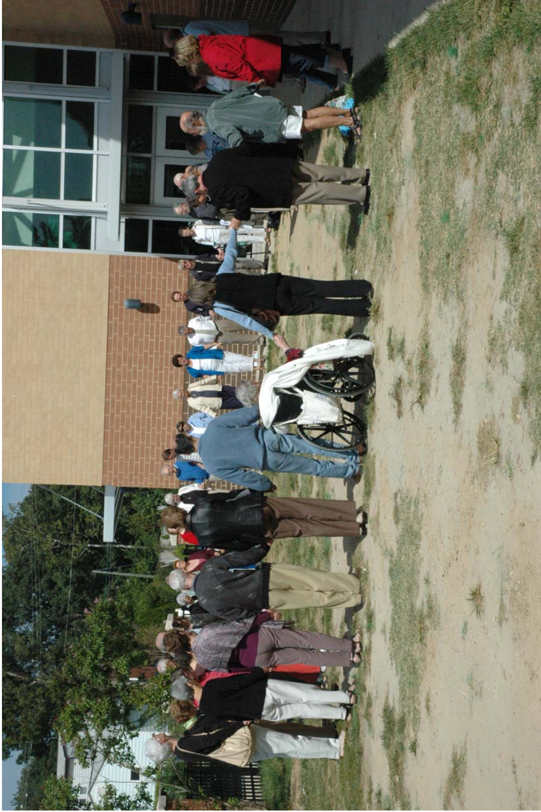
International Day of Peace, September 21, Moment of Silence after Liturgy