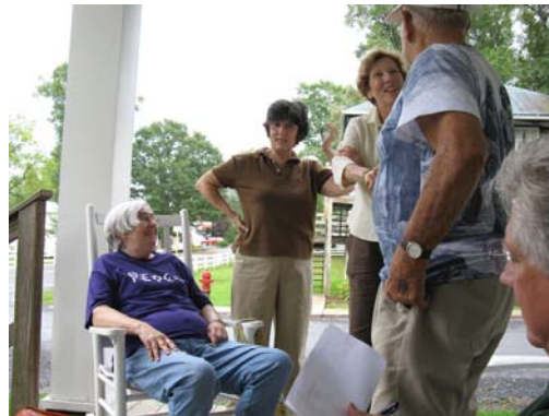
Grandmoms Plus . . .