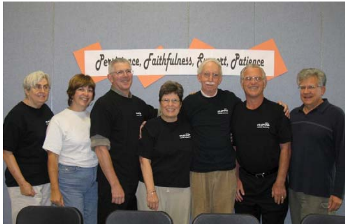
Social Justice Liturgy Planners . . .