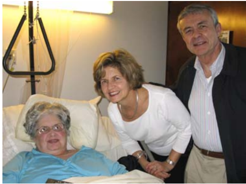
The Mariscals visit from Mexico.