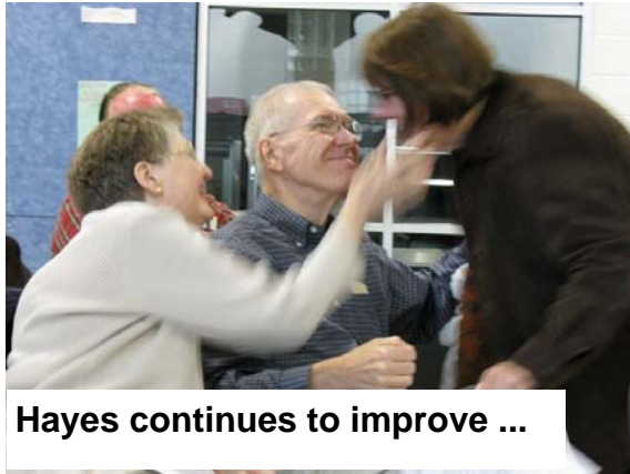
Hayes continues to improve ...