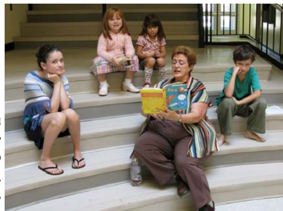
Victoria story-telling to NOVA kids