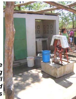
Midwife showing New Well and showers

The week included some lively discussions on liberation theology and the Vatican's suppression of it. We met people who were very passionate about the promise of the Gospel. We met folks who were about to leave us to go to Guatemala to support colleges who had been threatened with death for working with the poor. It seems drug dealers and right wing reactionaries will do almost anything to keep things from changing. There was new hope that the dreams of the Sand-