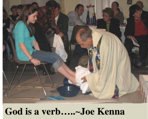
The Birch Family at Easter