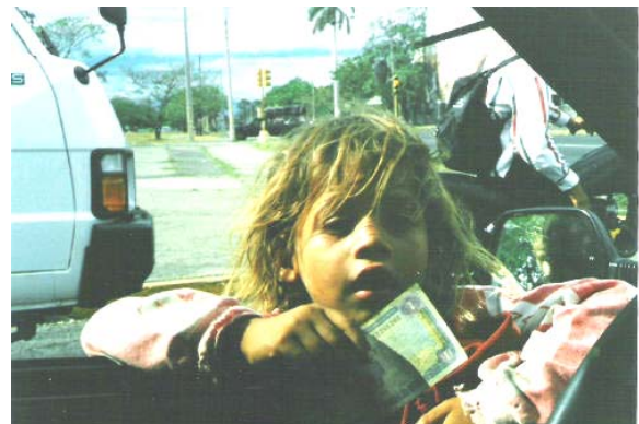
Six and eight year old children like this girl, in bare feet, with no parents anywhere to be seen, beg from automobiles at stoplights. http://www.runet.edu/~gmartin/Nica%20-%20Managua%20photos.htm

Nicaragua has no shortage of poor. Over 80 percent of Nicaragua's five million people earn between $1 and $2 a day. The average education of the rural Nicaraguan is third grade. The people in the cities average a sixth grade education. Fifty percent do not have a source of portable water in their homes. For the rural poor the water situation is serious. Their community wells are being impacted by a shortening of the rainy season. The wells are running dry before the rains come each year.