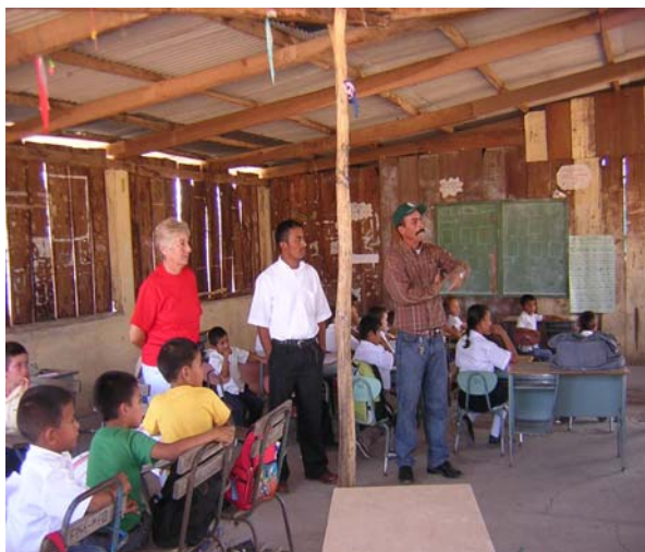
Large school, before repairs

We also heard from people what it was like growing up in Nicaragua and how the contra war of the 1980s affected the ordinary people of Nicaragua. It was quite distressing to hear how much misery the U.S. foreign policy brought to this country. Over half of the Nicaraguan national budget had to be spent on the war during those years. Many good people, including aid workers who worked with the Center were killed by the Contras. When I was in grammar school I was told that the Communists were the bad guys and the Americans were the good guys. I will never take U.S. foreign policy at face value again. I had known that U.S. foreign policy could be destructive but I had