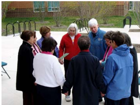
Pray for Peace

January 11-13, 2008 ... NOVA'S 40 th Anniversary Celebration