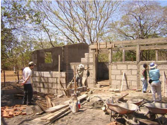
Community Center being built

never faced concrete examples of harm done by my government. Seeing harm done by my tax dollars was the part of the trip that disturbed me the most.