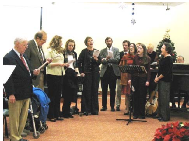
Our faithful and talented music group