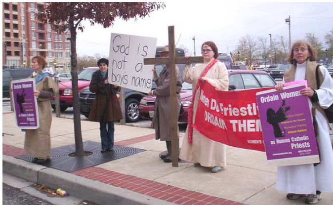
November 12, 2006—Baltimore, MD Outside of Bishops Conference

May I become at all times, both now and forever