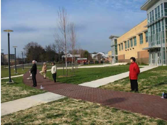
Waiting for Peace. Nova Grandmothers (and friends) stand, wait and pray outdoors, before each liturgy, each Sunday