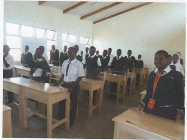
New students in new classrooms for new experience