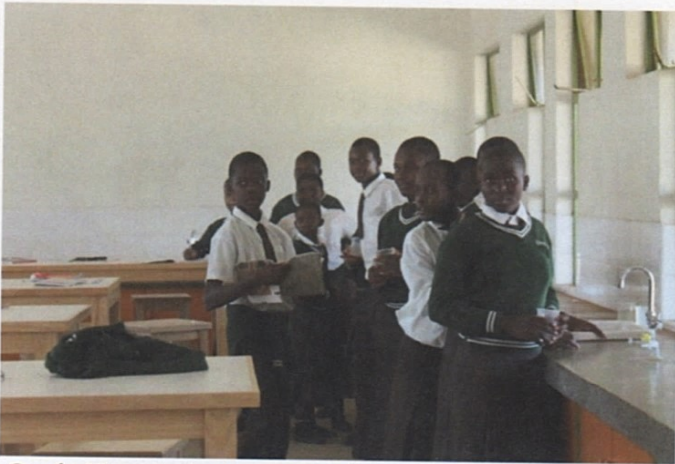
Grade Nine students eager to learn in new Science Lab