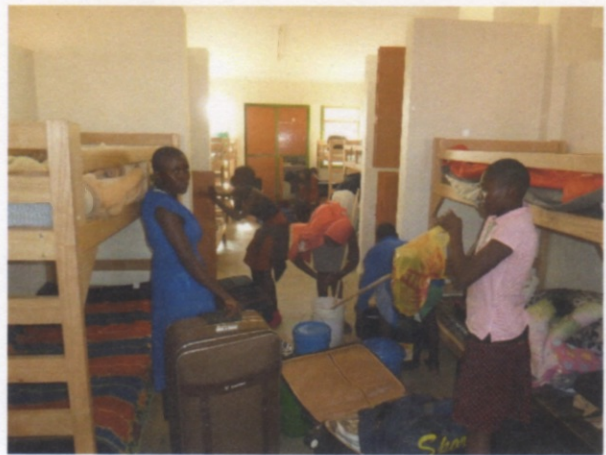
Girls unpacking on arrival day, making themselves feel at home in their new dormitory!