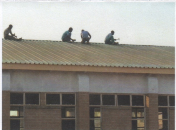
Construction team putting some finishing touches on the new classroom block, ready for Phase Two!

LOOK AT THESE PHOTOS AND KNOW WHAT YOUR SUPPORT HAS DONE – ENCOURAGEMENT AND SUGGESTIONS, REFERENCES AND DONATIONS!