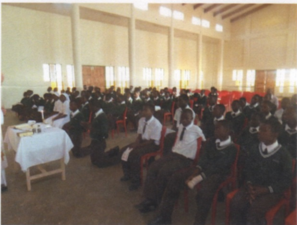
Students gather for morning Mass to start off a good day of learning in the best of Jesuit Pedagogy!

Donations can be made to "Jesuit Missions, Inc.," for Malawi Jesuit school; send to Jesuit Missions, 1016 16 th St. NW, Suite 400, Washington, DC 20016