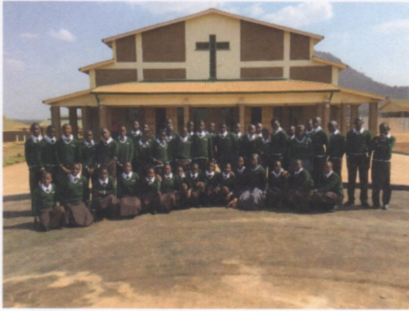
Grade Nine in new uniforms pose before Assembly Hall on first day of class – handsome and ready!