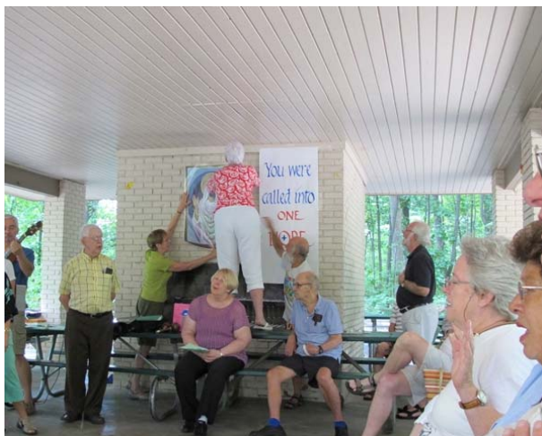
Setting up for liturgy on July 29