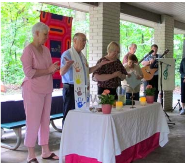
From the liturgy on July 22