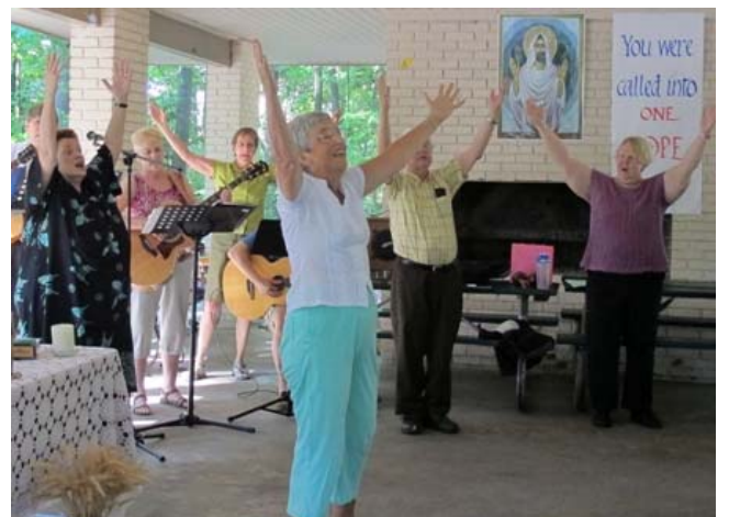
Praising with joyful song