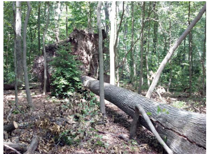
Reminder of why the liturgy was cancelled on July 1

Remember these and any other NOVA members and their friends and family who need our prayers.