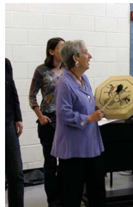
Gloria in Joyful Song