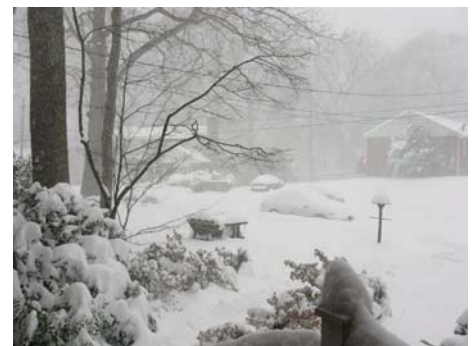
Snowed in 4 th Sunday of Advent – No Nova liturgy

"Where do I find hope and joy on the beltway, this year?"