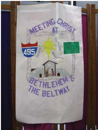
2009 Advent Theme