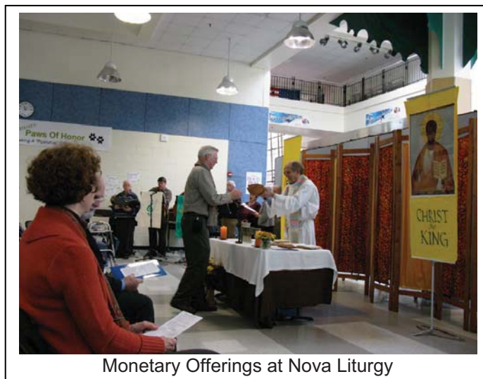
Monetary Offerings at Nova Liturgy