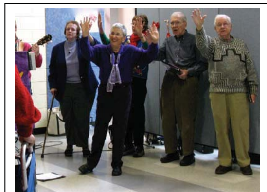
Nova Singers, who weekly share their time and talents.