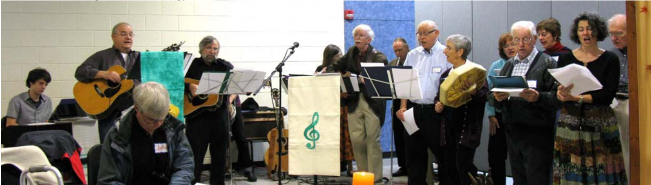
Nova and Pax Singers-Joint Liturgy on November 1