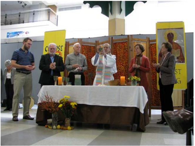
November 22, 2009 Liturgy